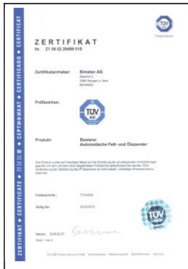
Certificate for equipment safety. Valid for all simalube lubricators.

In addition to the aforementioned certificates, we also have various product certificates. The most important ones are certificates for equipment safety and various design tests for explosion protection.