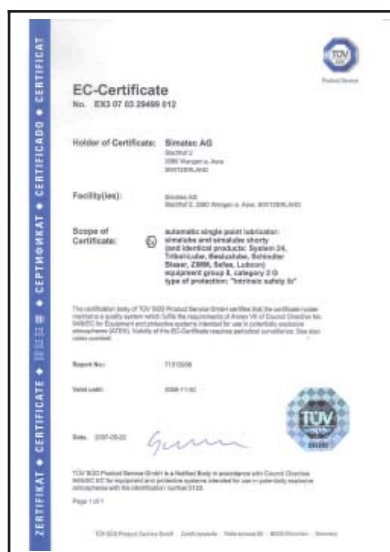
ATEX certificate of simatec ag. Applies to all lubricators made by simatec.

The QM system of simatec ag complies with the requirements of the latest ATEX guidelines, 94/9/EG for gadgets and safety systems for the intended use in explosive areas.