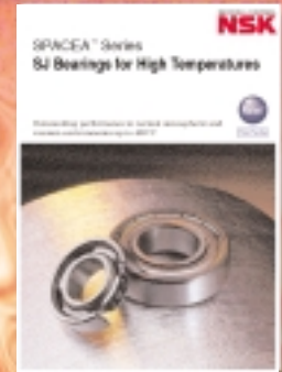
CAT. No. E1223