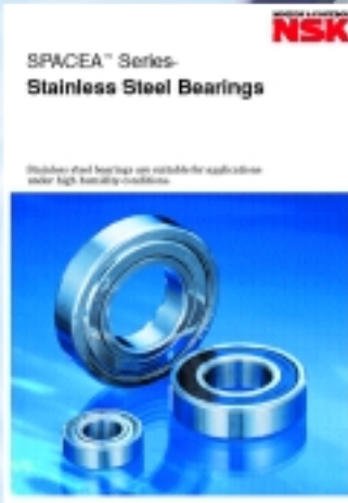
CAT. No. E1231